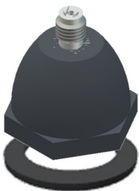
J44 BASE A16AA0341A J44P PAD A16AA0282A